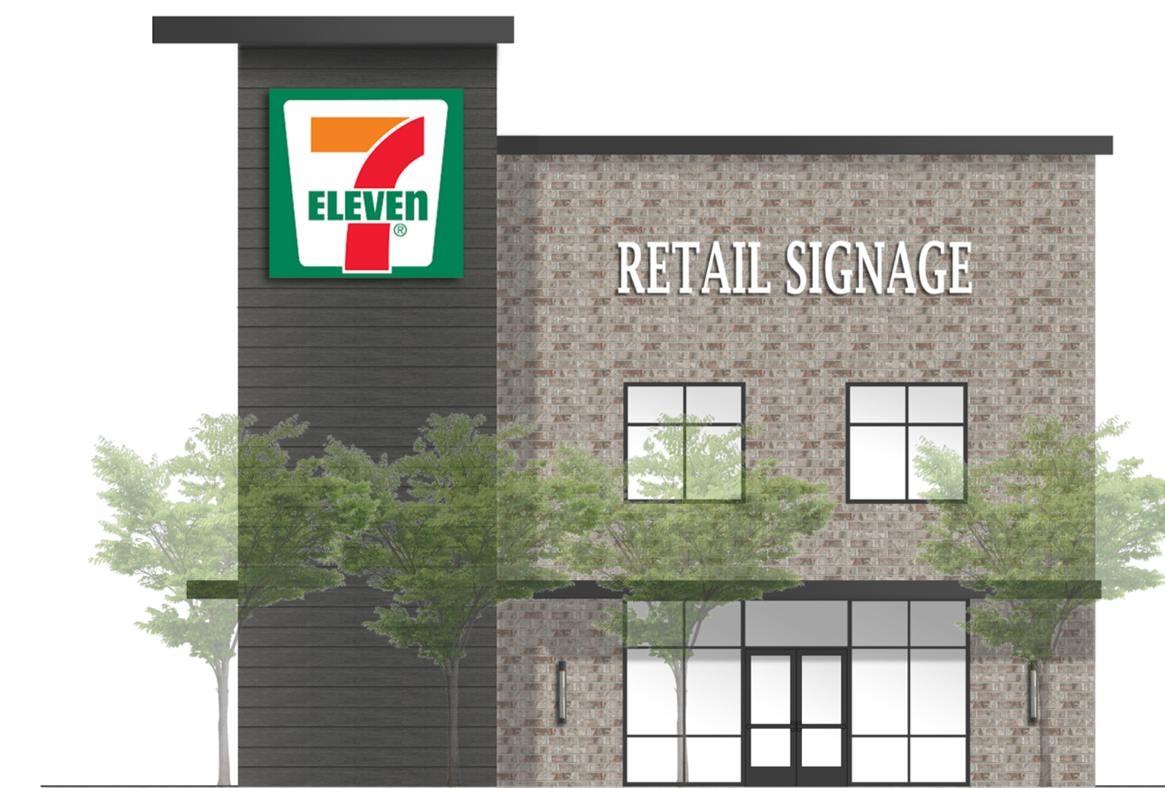
PRESTON ROAD ELEVATION