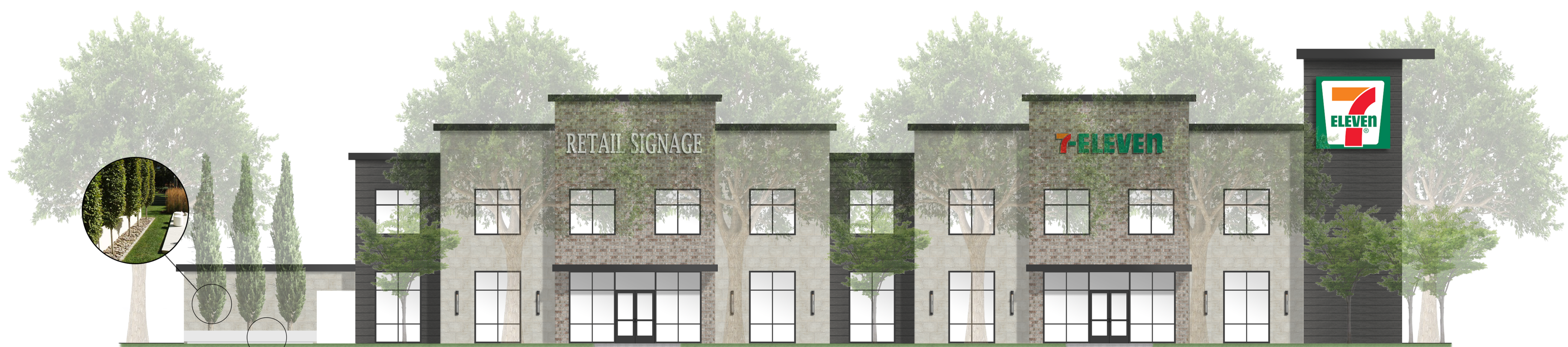
ALPHA ROAD ELEVATION